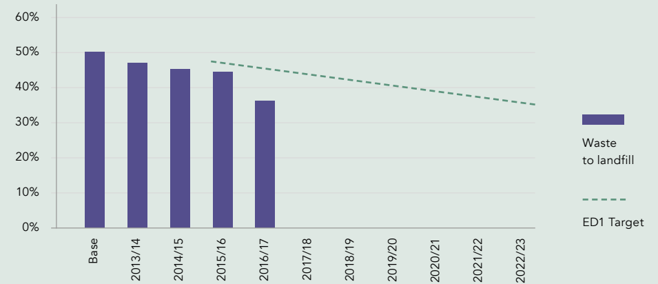
Percentage of waste to landfill