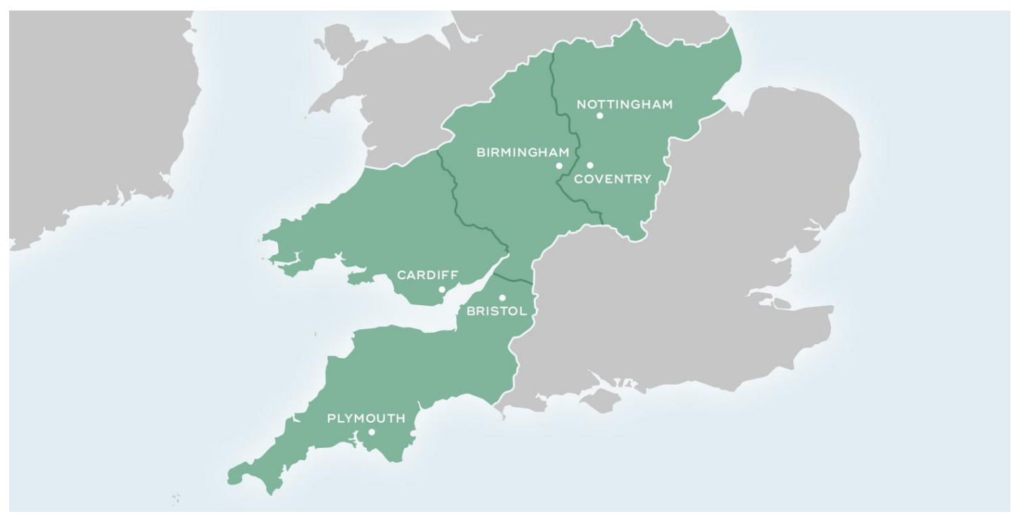
Figure 1: The area covered by the WPD network

WPD is one of the six Distribution Network Operators (DNOs) in the UK, our cables and wires deliver electricity to homes and businesses. We are not a supplier, we do not buy and sell electricity, or directly bill customers. Our network stretches from the Lincolnshire coast, across the Midlands, South Wales, and the South West to the Isles of Scilly.