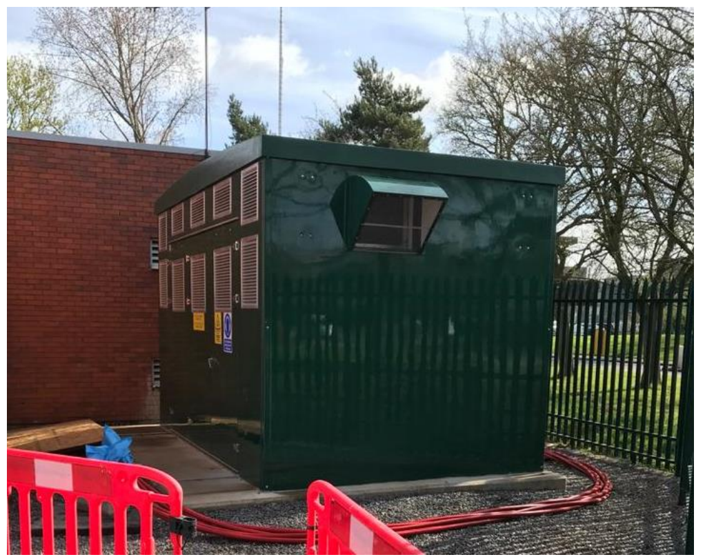
Figure 2-2 EDGE-FCLi installed in its final position at UoW