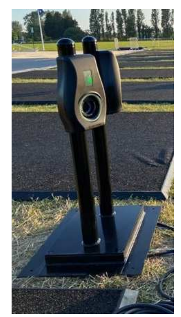
Figure 5-2 Photograph of proposed EVCP arrangement for temporary events

Temporary EV charge points were also specified for each of the case studies. During the first work package various stakeholders including those managing the events were engaged. This engagement defined what was required to provide efficient set up and break down of event equipment as well as ensuring the EVCPs were securely mounted and visible to users and event organisers that may be utilising the EVCPs. This analysis led to a post mounted EVCP. The project designed the connection process that this would require and outlined what the earthing and protection system would look like.