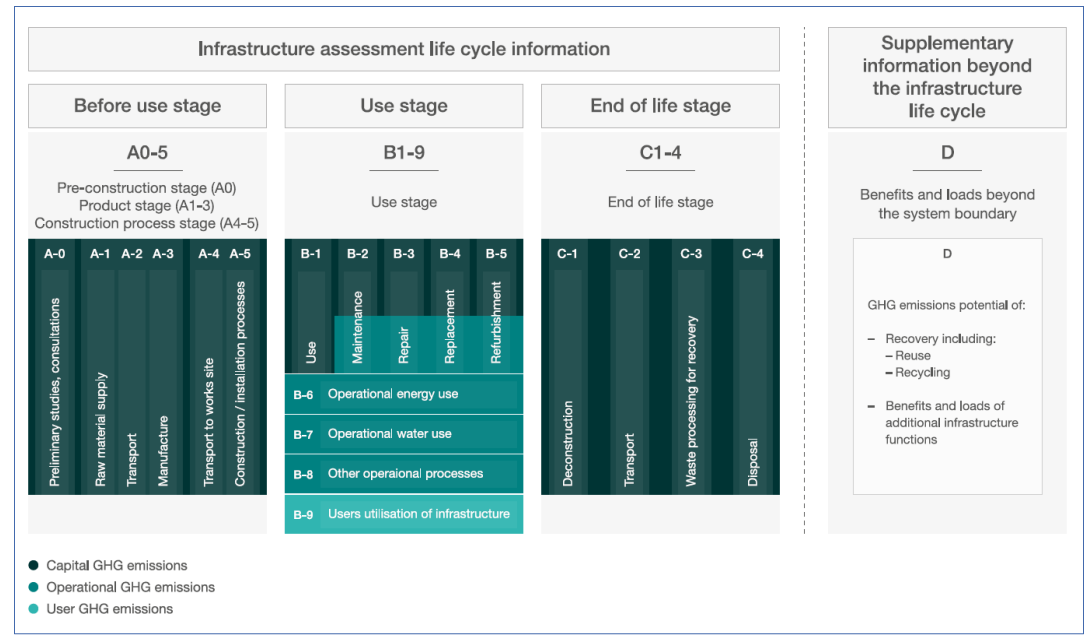
Figure 2 PAS 2080 modular approach showing the life cycle stages and individual modules for infrastructure carbon emission quantification

WP 3: WLCM Guidance and Methodology : Combining the outputs from WP1 and WP2, the project team developed a WLCM methodology, presenting the structure and underlying calculation methodology for the reporting tool and carbon database, as well as an understanding to how reporting can be integrated into NGED's existing project processes. The whole-life carbon calculation methodology, which is a aligned with GHG Protocol and the Defra emission factors guidance, follows the modular structure outlined in the PAS 2080 guidance, as shown in Figure 2.