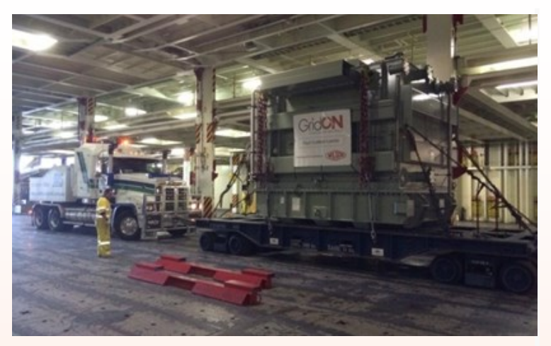
FCL on board vessel for transit to the UK