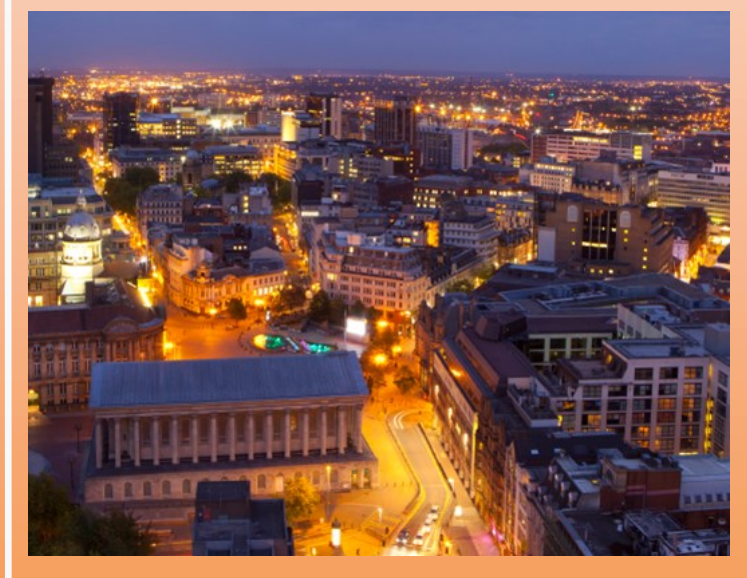
Birmingham City Centre

Thank you to everyone who took part in the survey.