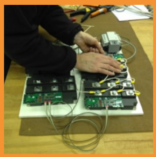
Connection of the Power Electronic FCL prototype