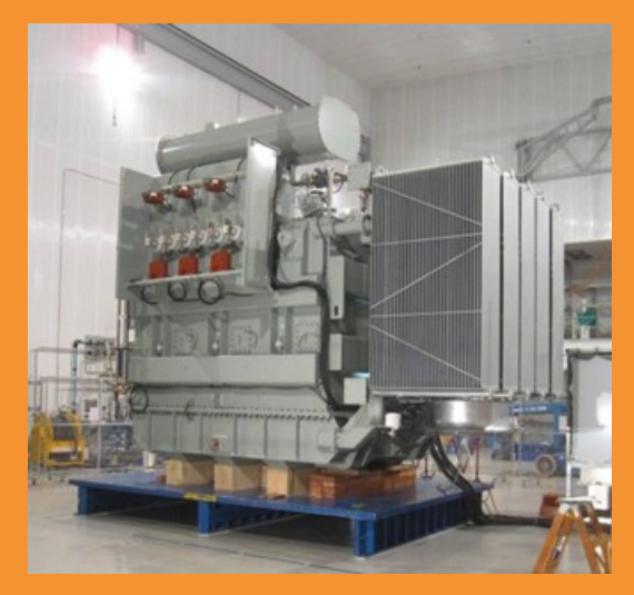
FCL in Factory testing

Removal of wall to install FLM equipment